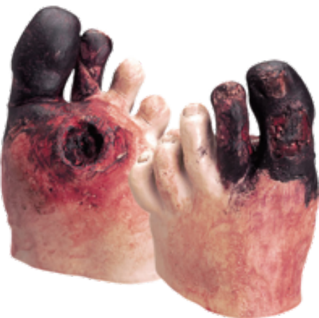
Foot Injury Kit 6009707959458 • Foot Injury Kit • Pictures for illustrative purposes only, the real product may differ.