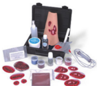
Wound Simulation 6009707959459 • Wound Simulation Basic, Deluxe or Multiple Wound & Casualty Kit • Pictures for illustrative purposes only, the real product may differ.