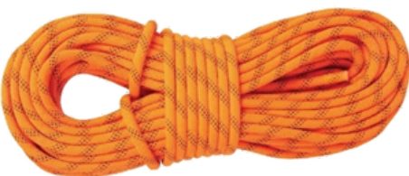
Rescue Rope 6009707959443