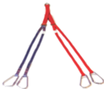
Bridal Lifting Harness & Carabiners 6009707959435