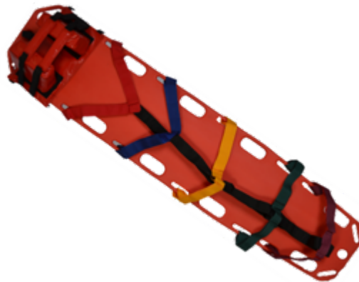
Trauma Spinal Kit