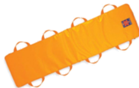
Flexible Evacuation Zip Stretcher