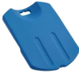
CPR - Board