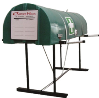
Stretcher Bin and Stand