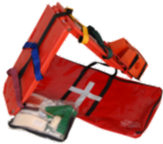
Trauma Spinal Kit - Foldable