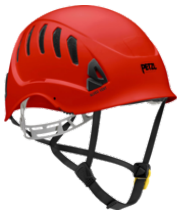
Rescue Helmet 6009707959444