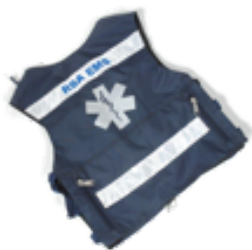
EMS - Utility Jacket 6009707959409