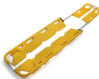
Scoop Stretcher Plastic