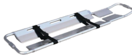
Scoop Stretcher Aluminum