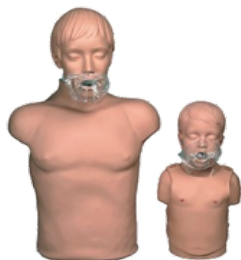
CPR Torso 6009707959460 • CPR Torso Adult / Child / Infant Disposable Lungs Optional – Carry Bag. • Pictures for illustrative purposes only, the real product may differ.