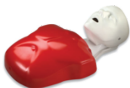
CPR Basic Buddy 6009707959461 • CPR Basic Buddy - Single or 5 Pack. • Pictures for illustrative purposes only, the real product may differ.