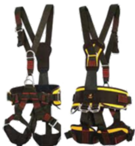
Rescue Harness 6009707959436